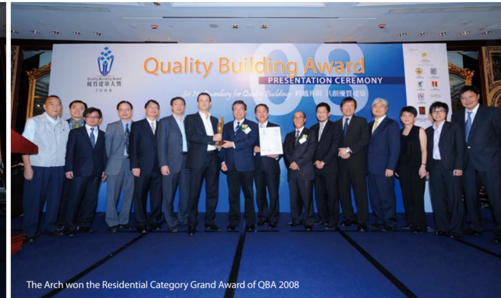
The Arch won the Residential Category Grand Award of QBA 2008