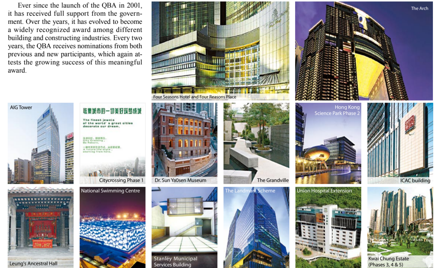
Congratulations to Quality Building Award 2008