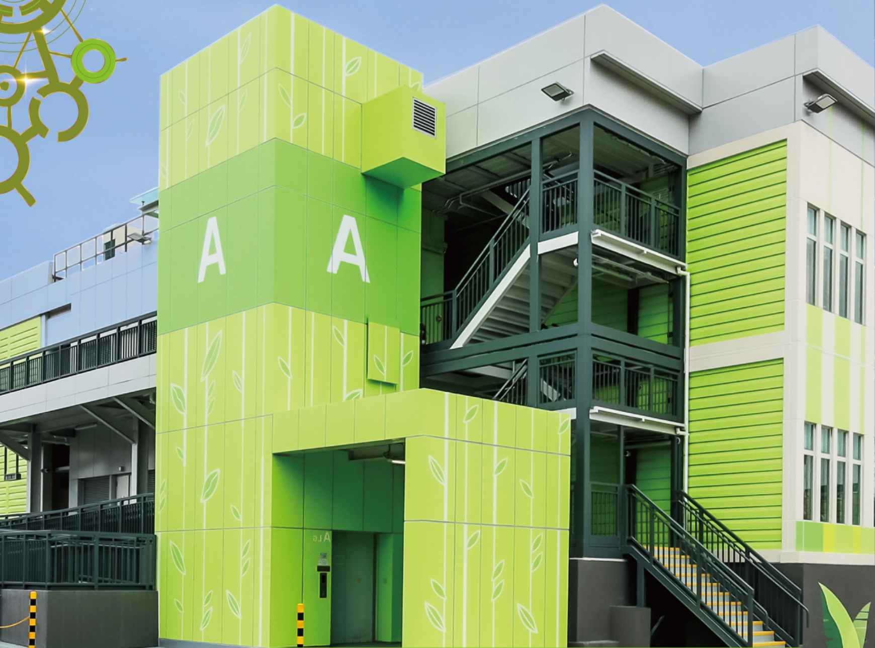
North Lantau Hospital Hong Kong Infection Control Centre QBA 2022-Innovative Project Award & Hong Kong Non-Residential (New Building – Government, Institution of Community) Grand Award